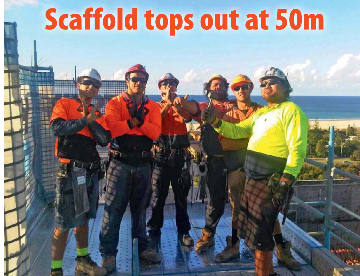
Rooftop celebration when scaffolding on Hutchies' Southern Cross University project hits the 50m mark.

THE scaffold for Hutchies' Southern Cross University project on the Gold Coast has reached its full height at almost 50 metres above ground.