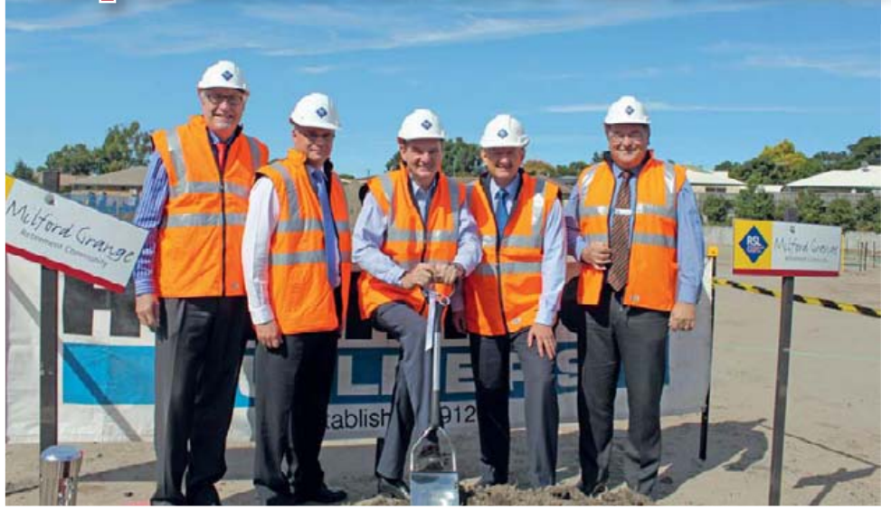
Dignitaries turn the first sod in stage two of the residential facilities at Milford Grange Retirement Community in Ipswich.

CONSTRUCTION of stage two of the residential living component at the RSL Care Milford Grange Retirement Community in Ipswich will take the number of available beds to 94.